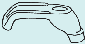
SECL-1 — Steel SECL-1U thru 5U — Malleable