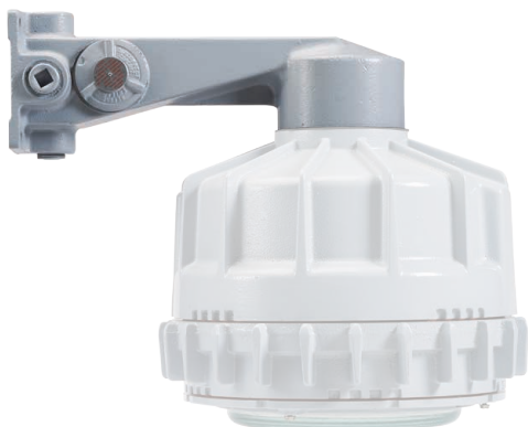
WALL BRACKET HOOD