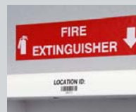
Safety Labels ...and many more!