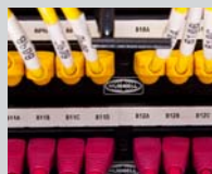
Voice & Data Communications