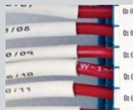
PermaSleeve® Wire Marking Sleeves