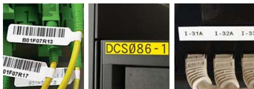
Flags / Tags