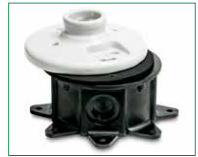
Porcelain Lamp Holder (P/N 16500), Silicone Gasket (P/N E05-003-000), and Junction Box (P/N 15246)

Use the part numbers below to facilitate and complete the installation as shown.