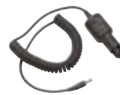
TI-CAR-CHARGER Thermal Imager Car Charger (all models except FlexCam)