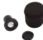
FLK-LENS/WIDE1 Wide-Angle Infrared Lens (Ti32, TiR32, Ti29, TiR29, Ti27 and TiR27 only)