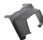
TI-VISOR Thermal Imager Sun Visor (all models except FlexCam)