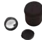
FLK-LENS/TELE1 Telephoto Infrared Lens (Ti32, TiR32, Ti29, TiR29, Ti27 and TiR27 only)