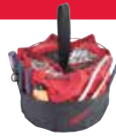
Contractor Parts Organizer 49-17-0110