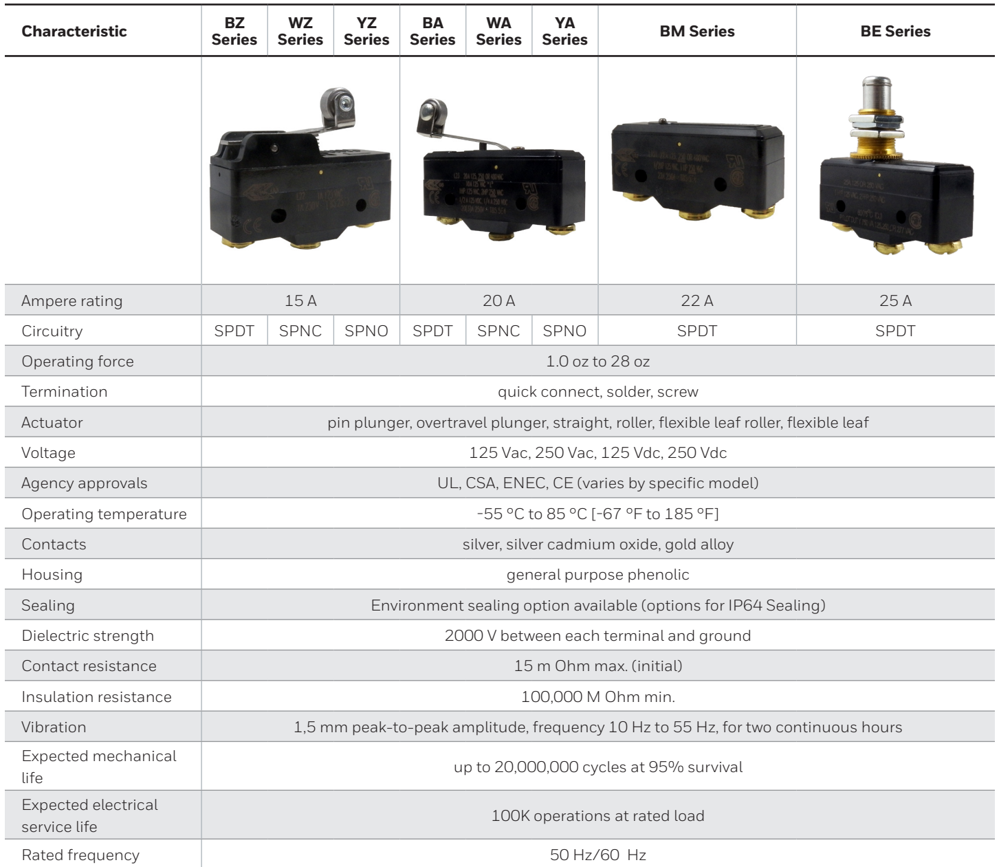
Table 1. Specifications