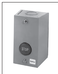
1 Push Button Surface Mounting