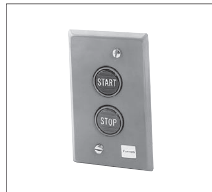
2 Push Buttons Flush Mounting, NEMA 1B