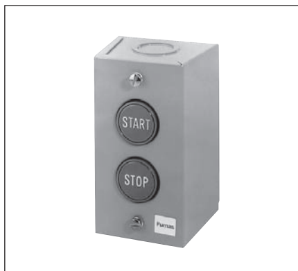
2 Push Buttons Surface Mounting, NEMA 1