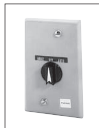
1 Selector Switch Flush Mounting