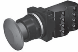
Plastic 1 3/4" Mushroom Head - Black Max