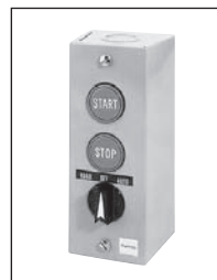
2 Push Buttons 1 Selector Switch