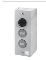
1 Pilot Light 2 Push Buttons