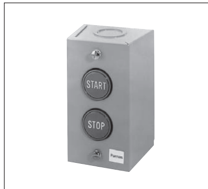
2 Push Buttons Surface Mounting, NEMA 1