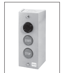
1 Pilot Light 2 Push Buttons