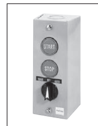
2 Push Buttons 1 Selector Switch