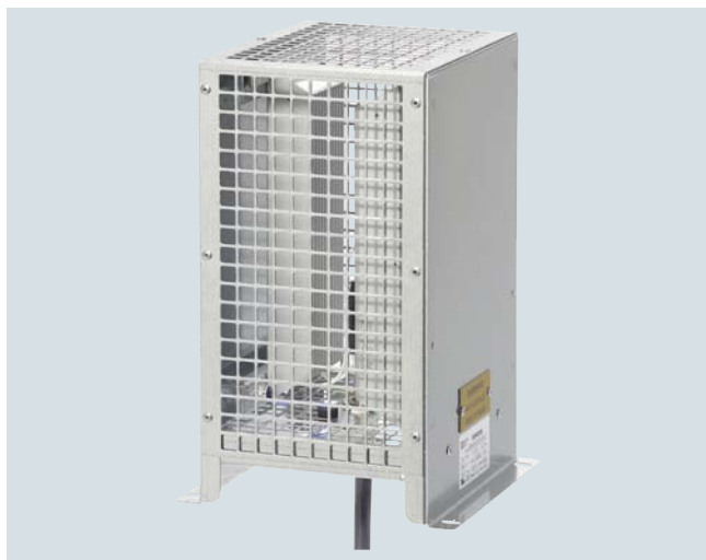
Braking resistor for PM240-2 Power Modules, frame size FSD