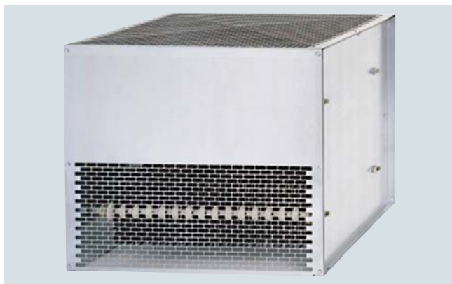
Braking resistor for PM240 Power Modules, frame size FSGX

Excess energy in the DC link is dissipated in the braking resistor. The braking resistors are intended for use with PM240 and PM240-2 Power Modules which feature an integrated braking chopper, but cannot regenerate energy to the supply system. There is an optional plug-in Braking Module for frame size FSGX. For regenerative operation, e.g. the braking of a rotating mass with high moment of inertia, a braking resistor must be connected to convert the resulting energy into heat.