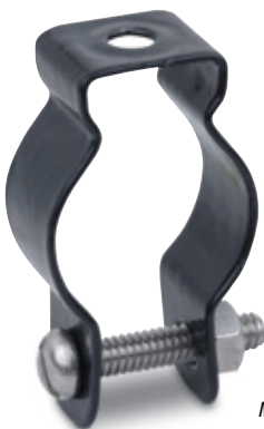
MINE3/4-G Mini Conduit Hanger