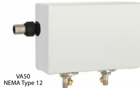
VA50 NEMA Type 12