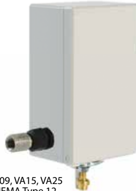
VA09, VA15, VA25 NEMA Type 12