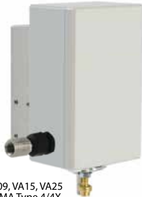
VA09, VA15, VA25 NEMA Type 4/4X