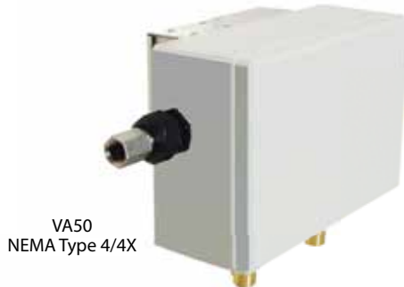
VA50 NEMA Type 4/4X